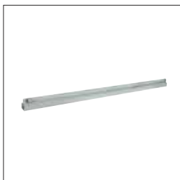
Lampa fluorescenta FIA EUR 21.00 cu instalatie electrica completa 1x40W Cod 019.010.110.000