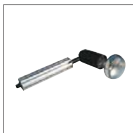
Lampa spot stut OCTANORM EUR 18.00 Cod 019.010.187.000