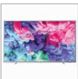
TV LED SMART 4K, EUR 50.00/zi UHD ultrasubtire (diagonala ecran: 126 cm) Cod 025 010 130 045