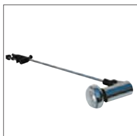
Lampa spot cu brat EUR 18.00 Cod 019.010.180.000