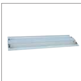
Corp fluorescent tip EUR 26.00 OCTANORM cu doua tuburi D-171 Cod 019.010.200.000