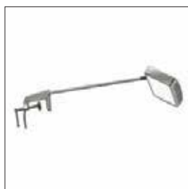
Reflector tija LED A++ 16W 1100LM 4000K ARM33CM EUR 45.00 Cod 019.010.200.040