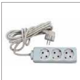
Prelungitor 230V, 10A, 3m EUR 15.00 Cod 019.010.277.000