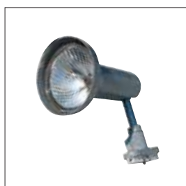
Spot halogen SY STAR 100W EUR 21.00 Cod 019.010.185.000