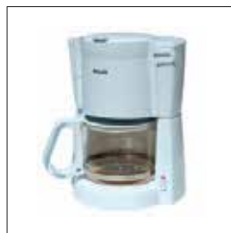
Filtru de cafea EUR 8.00 Cod 025.010.120.010