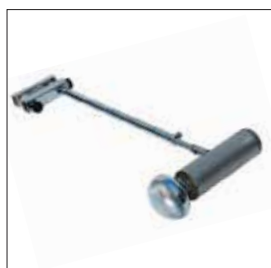
Lampa spot cu brat 100W EUR 18.00 Cod 019.010.181.000