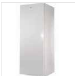
Frigider ARCTIC 255 l EUR 65.00 Cod 025 010 020 199