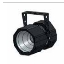
Reflector LED VIRGO 40W 4350 LM 4100 K EUR 50.00 Cod 019.010.200.045