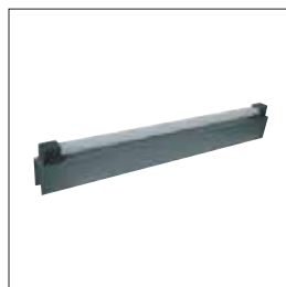
Corp fluorescent tip SS30 EUR 21.00 cu un tub D-170 Cod 019.010.190.000