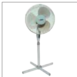
Ventilator cu picior EUR 11.00 Cod 025.010.500.020