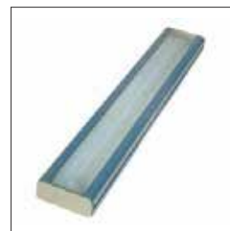
Corp fluorescent tip EUR 24.00 SYMA STAR Cod 019.010.200.001