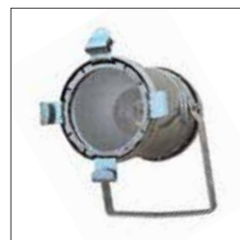
Reflector HIGHLITE HQI 150W EUR 45.00 Cod 019.010.390.000