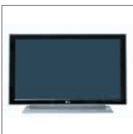
TV Plasma EUR 31.00/zi (diagonala ecran: 107 cm) Cod 025 010 130 040