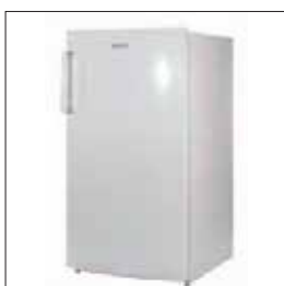
Frigider ARCTIC FB 155 EUR 31.00 Cod 025 010 020 198