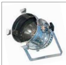
Reflector PAR64 500-1000W EUR 50.00 Cod 019.010.200.020