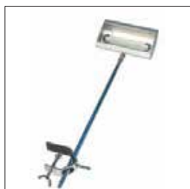
Reflector cu brat 300W EUR 45.00 Cod 019.010.200.010