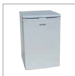
Racitor (140 l) EUR 31.00 Cod 025 010 070 010 (55 x 61 x 84 cm)