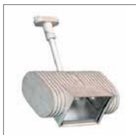
Reflector halogen SYMA STAR 300W EUR 45.00 Cod 019.010.200.006