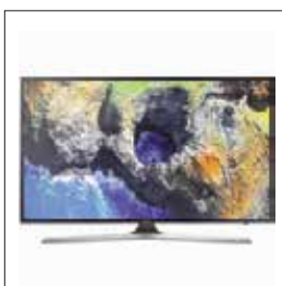
TV SAMSUNG UHD, EUR 75.00/zi (diagonala ecran: 163 cm) Cod 025 010 130 047