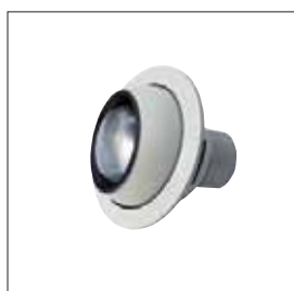
Lampa spot 100W EUR 18.00 Cod 019.010.170.000