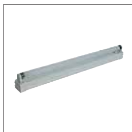
Corp fluorescent tip SS30 EUR 24.00 cu un tub D-170 - A Cod 019.010.190.001