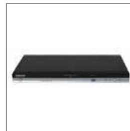
DVD Player EUR 50.00 Cod 025 010 130 030