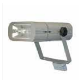
Reflector IVEN HQI 150W EUR 45.00 Cod 019.010.200.005