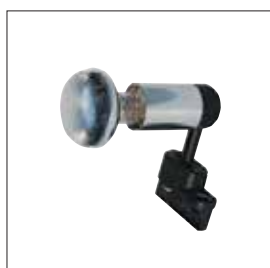
Lampa spot 100W EUR 18.00 Cod 019.010.188.000