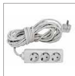
Prelungitor 230V, 10A, 5m EUR 15.00 Cod 019.010.279.000