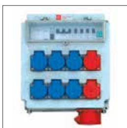
Panou Electric EUR 140.00 OCTANORM Cod 019.010.275.000