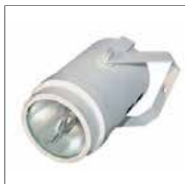
Reflector HQI 80W EUR 45.00 Cod 019.010.200.030