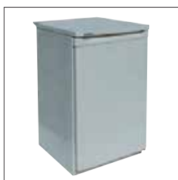
Frigider ARCTIC (180 l) EUR 54.00 Cod 025 010 070 020