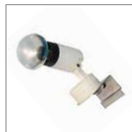
Lampa spot SS30 100W EUR 18.00 Cod 019.010.200.008