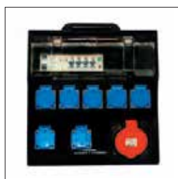
Panou Electric 380V/220V EUR 120.00 Cod 019.010.265.000