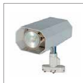
Spot halogen SY STAR 50W(A) EUR 21.00 Cod 019.010.186.000